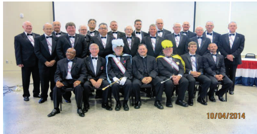
Fourth Degree Exemplification, October 4, St. Mary of the Springs Parish Hall